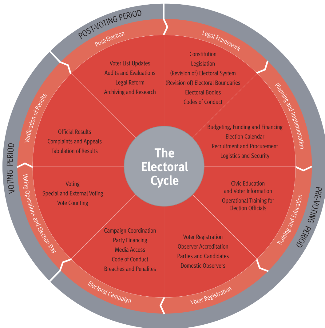
FIGURE 1.2 ELECTORAL CYCLE